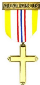
Ad Altare Dei

Designed for 8 to 10-year-old Cub Scouts.