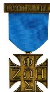
Light is Life

Designed for any Roman Catholic youth registered in a Scouts BSA Troop, Venturing Crew or Sea Scout Ship.