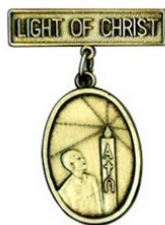
Light of Christ

Designed for 6 and 7-year-old Cub Scouts.