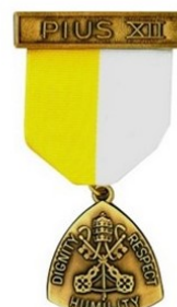
Pope Pius XII

Designed for 12 and 13-year-old Scouts of the Eastern-rite Catholic Churches. Scouts in the Eastern Catholic Churches work on Light is Life instead of the Ad Altare Dei emblem.